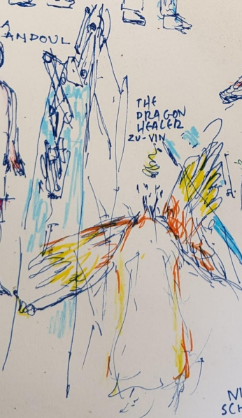
THE DRAGON HEALER ZU-VIN